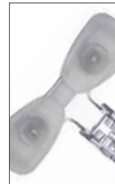
Flexible, one-piece forehead pads conform to the shape of your face