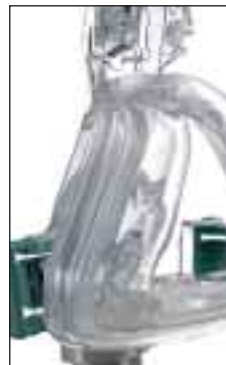
Soft Mirage dual-wall cushion optimizes seal and minimizes pressure on the bridge of your nose

The Ultra Mirage has been proving it for over five years—quietly. The Ultra Mirage II continues to redefine what you can expect from the leading nasal mask in the market.