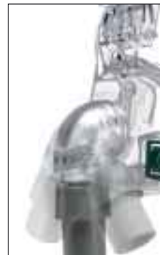
360° elbow rotation lets you choose the most convenient tube position