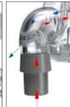
Unique air vent design reduces noise by directing the flow of air that is being inhaled and exhaled